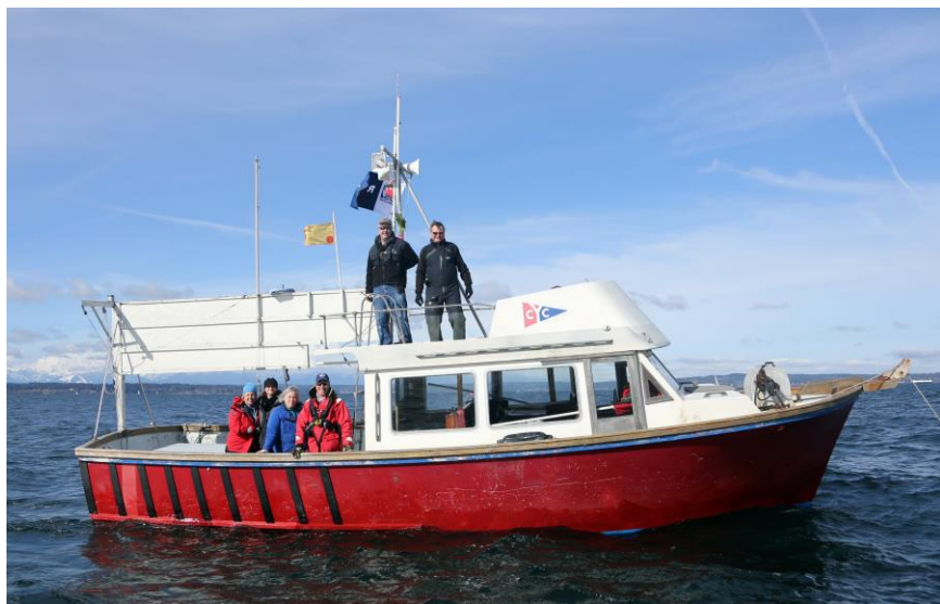
CYC YC 5 at Center Sound Series Blakely Rock Race