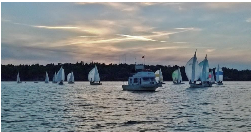
J/24 racing in the Tuesday Evening Series