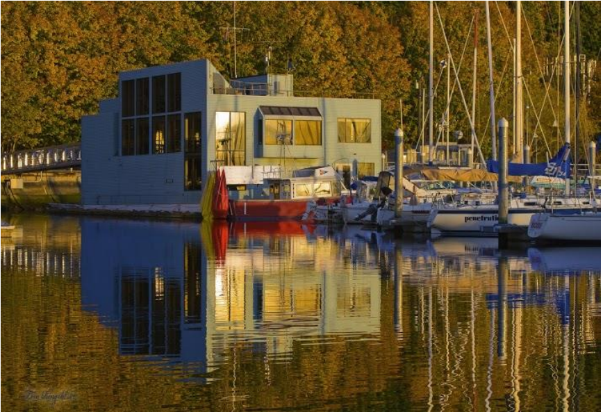
Clubhouse at Shilshole Bay Marina, Ballard