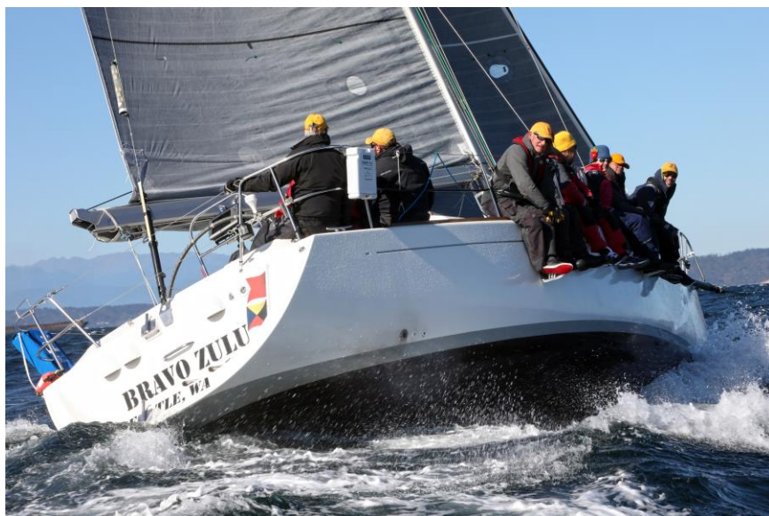
Bravo Zulu at Puget Sound Sailing Championship (PSSC)