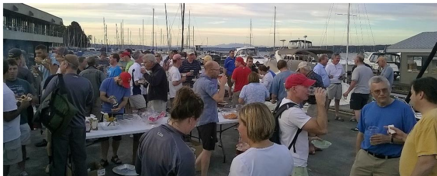
Club hosted barbeques after each series

Registration Deadline: September 12, 2019 (Thursday)