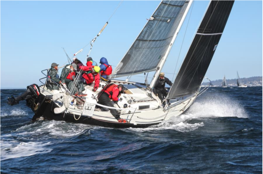
Here & Now – 2018 Boat of the Year