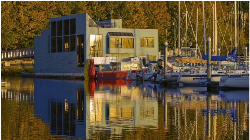
Clubhouse at Shilshole Bay Marina, Ballard

We have the club to do more of what we, as sailors, want to do together than we could on our own. The love of sailing is our bond and the interaction of our great people is our value. The club is our platform to help us share our excellent sailing lifestyle with more people and do more with each other and for each other.