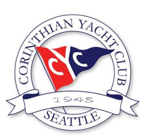
Sharing the Sailing Community